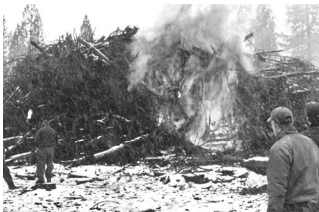
Figure 1. Open pile burn of forest fuel treatment woody biomass in Lake Tahoe Basin.

The Placer County Air Pollution Control District (PCAPCD), with responsibility for managing air quality in Placer County, shares regulatory authority over open burning with local fire agencies. Open burning is problematic because of the limited time of year it can be conducted, subsequent monitoring of smoldering piles for days after they are lit, and the production of significant quantities of air pollutant emissions and esthetically displeasing residuals (blackened logs and woody debris). The PCAPCD expends significant resources reviewing smoke management plans, issuing burn permits, inspecting burn piles, and responding to complaints from smoke.